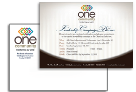
Event Envelope 5.8 x 4.4 Event Card 5.5 x 4.3