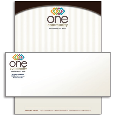
Letterhead 8.5 x 11 - 1-sided No.10 Envelope 9.2 x 4.1