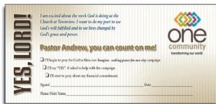
First Steps Card 8.6 x 3.7