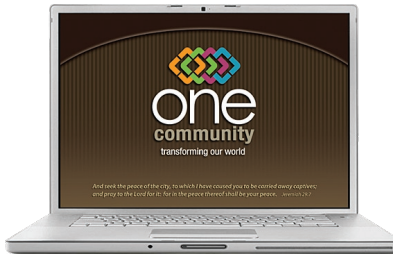
PowerPoint Slides ( Intro and Shell Page )