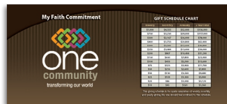
Commitment Card 8.5 x 3.5 - 2-sided